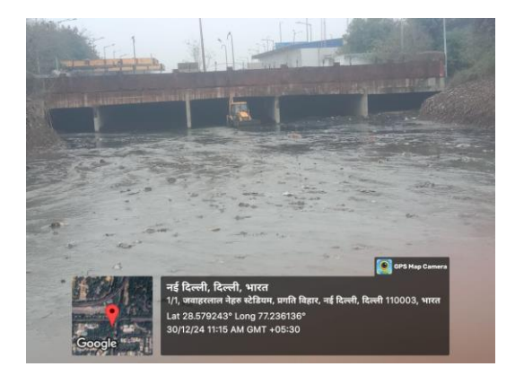
Outlet of the covered drain

(b) Sunheripulla drain: Length of drain: 940 meter (approx.), Width: 10 meter x 5 meter (5 box water - channels)